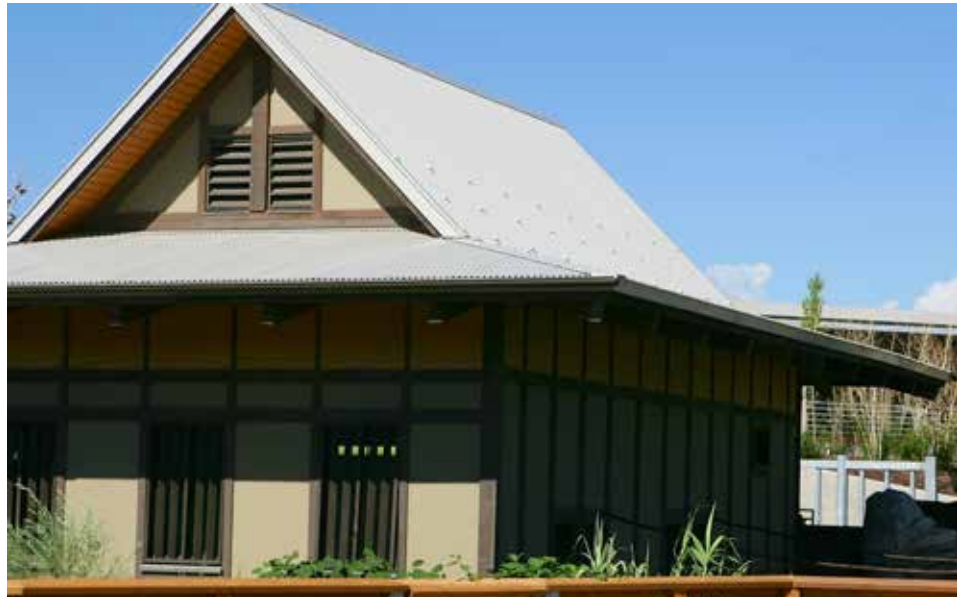
Denver Zoo, Denver, CO

Water Penetration: None at 12 psf when tested according to ASTM E 1646.