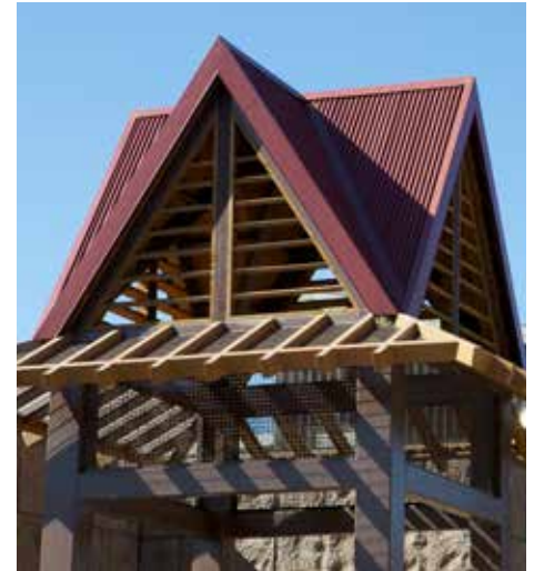
Denver Zoo, Denver, CO