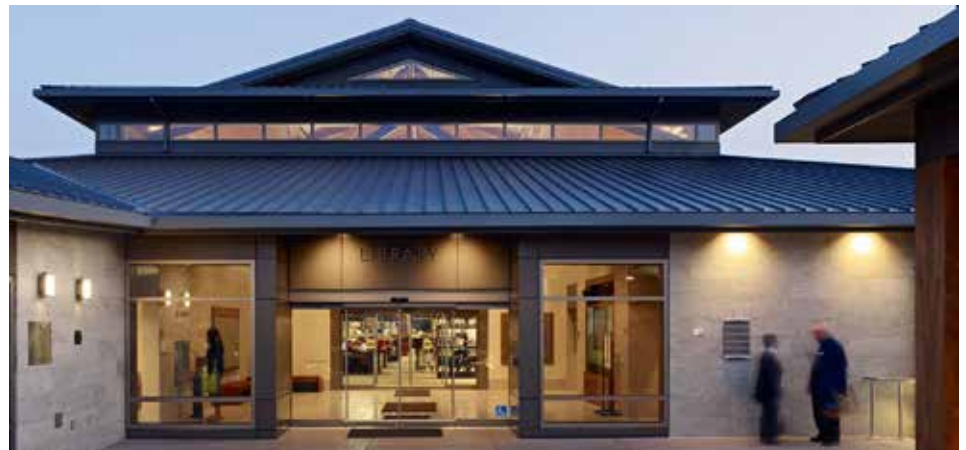
Lafayette Library and Learning Center, Lafayette, CA

Verify that site conditions are acceptable for installation. Do not proceed with installation until unacceptable conditions are corrected. Comply with panel manufacturer's installation instructions including but not limited to special techniques, interface with other work, and integration of systems. Fasten met-