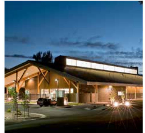
Show Low Library, Show Low, AZ

Performance of Exterior Windows, Doors, Skylights and Curtain Walls by Uniform Static Air Pressure Difference.