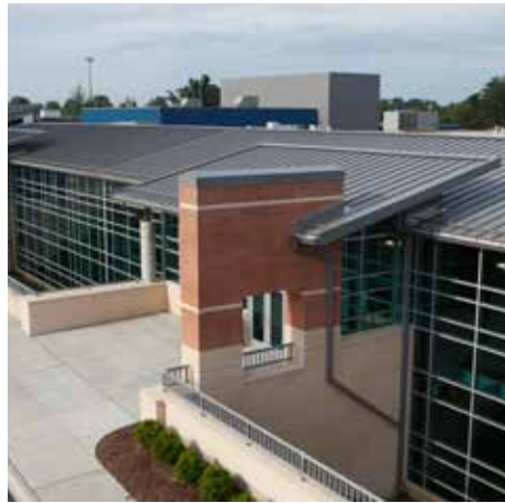
Charlestown High School, Charlestown, IN

Wind Uplift Resistance: Tested according to ASTM E 1592 and in compliance with UL 580, Class 90 Wind Uplift, Construction #506, 506A and 506B Wind Evaluation: Complies with requirements of Texas Windstorm Evaluation RC-197