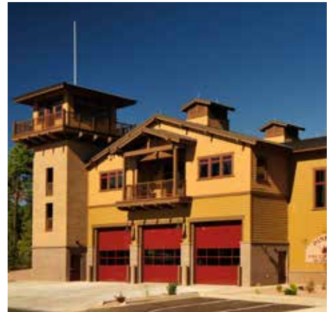
Pinetop Fire Station, Pinetop, AZ

No specific maintenance is required for properly installed Metal Sales standing seam panel products. Periodic roof inspection to verify system integrity, drainage functionality and repair of storm damage is advised.