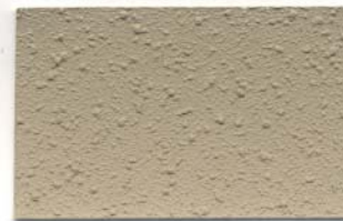
SURREY BEIGE 42B-3T