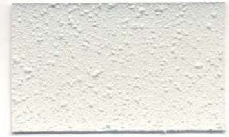
REGAL WHITE 93J-B3