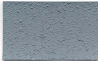
BLUE GRAY 94W-5S