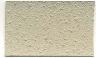
LIGHT STONE 68K-M7