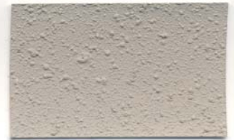
TAUPE SAND 72B-3J

NOTE: Colors printed on this page may not exactly match actual panel colors. Please request panel swatch for true color match.