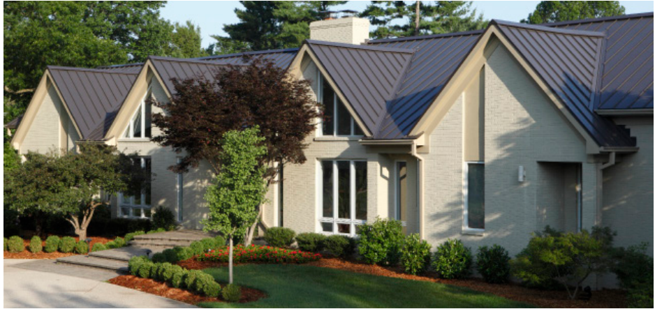
Residence, Louisville, KY

▶ Rib Height: 1 inch (25.4 mm) or 1-1/2 inches (38.1 mm).