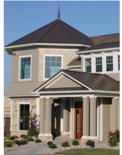
Denzinger Dentist Office, New Albany, IN

tural Standing Seam Steel Roof Panel Systems.