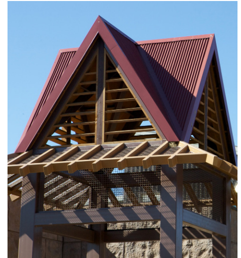
Denver Zoo, Denver, CO