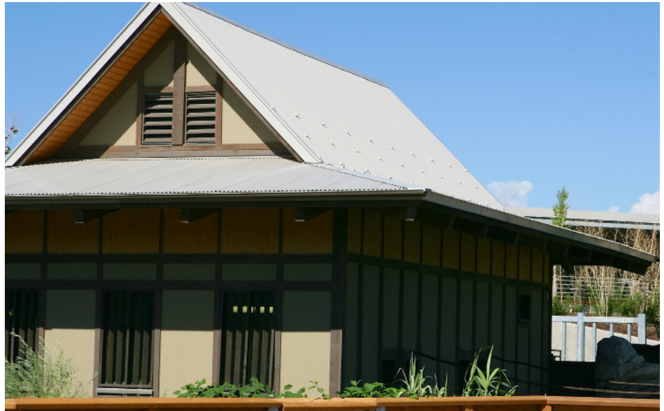
Denver Zoo, Denver, CO