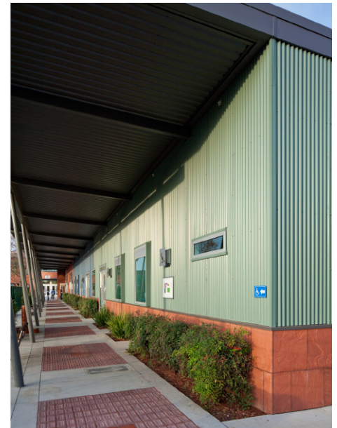
Silicon Valley Animal Center, Milpitas, CA