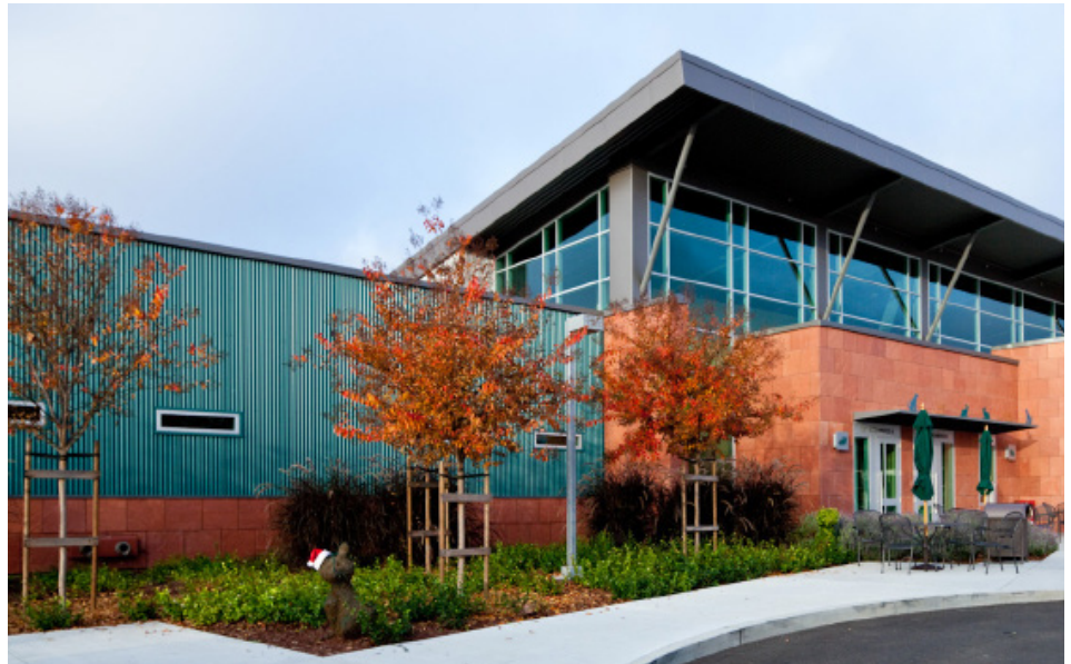
Silicon Valley Animal Center, Milpitas, CA