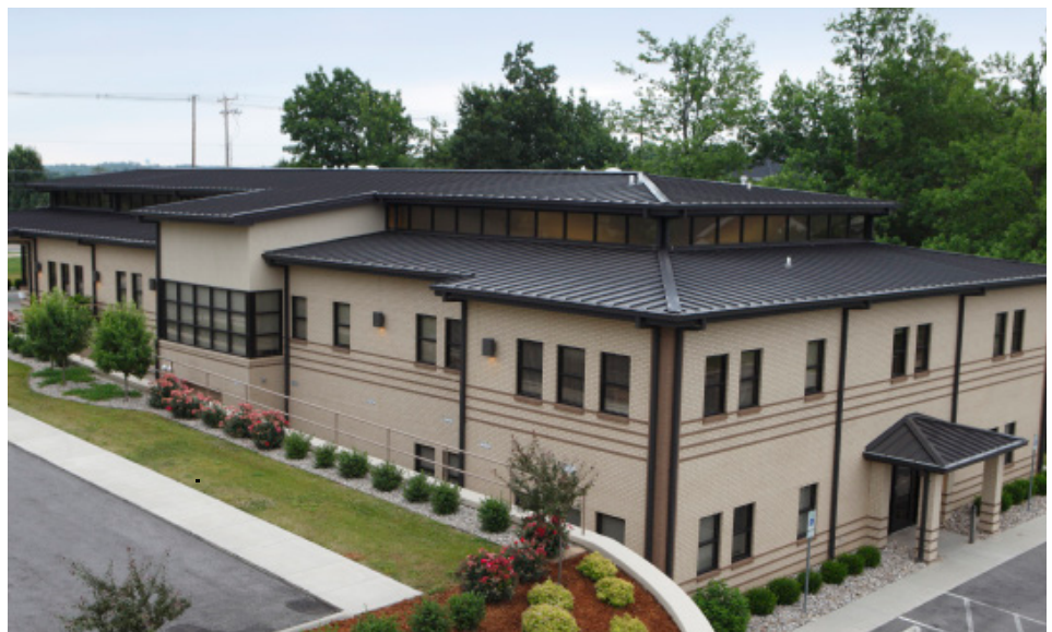
Medical Office, Elizabethtown, KY