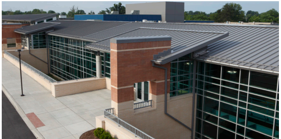
Charlestown High School, Charlestown, IN

To minimize possible differences in appearance, an entire project should be painted at one time, from one batch of paint, using the same application equipment. Additionally, fabricated panels, flat