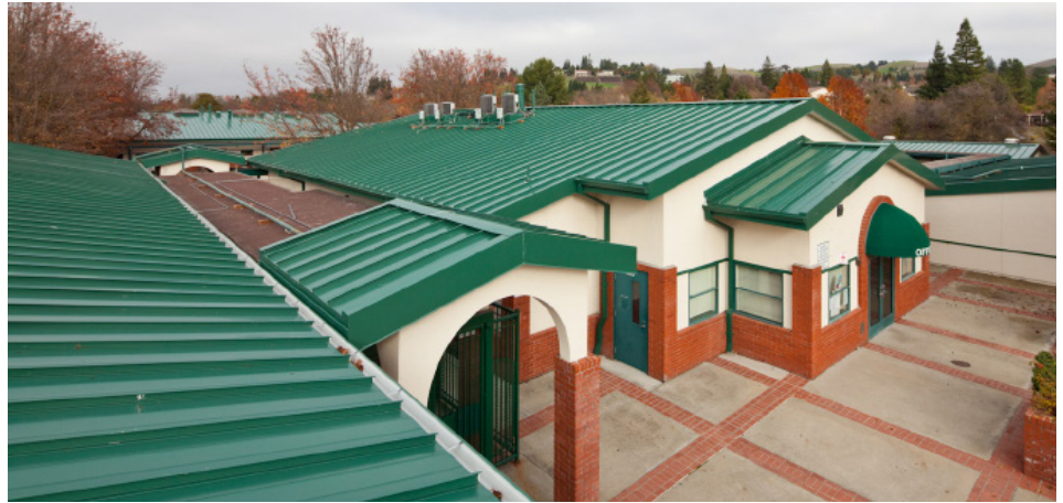
Charlotte Wood Middle School, Danville, CA