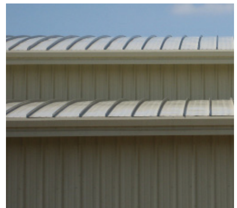
Visitor Center, Tuscon, AZ