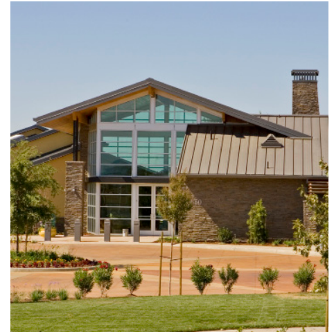
Club Lincoln Crossing, Lincoln, CA