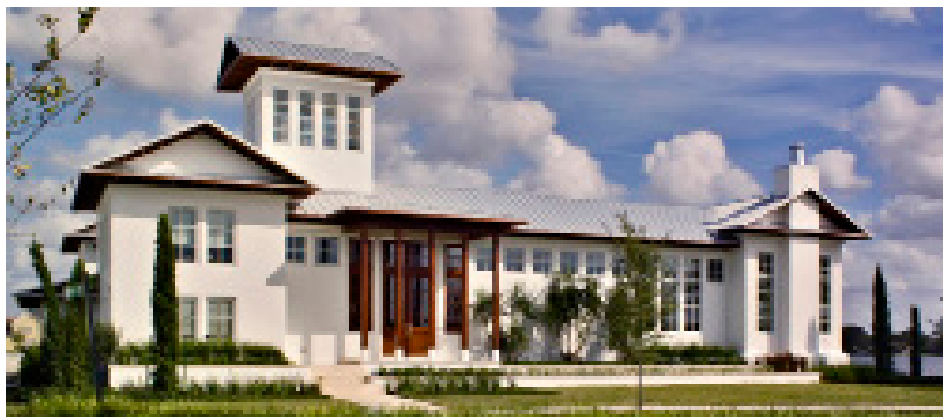
Tradewinds Model Home, FL

Additional product information is available from the manufacturer upon request. Metal Sales product information may be found in McGraw-Hill Sweets, BSD SpecLink and Arcom MasterSpec.