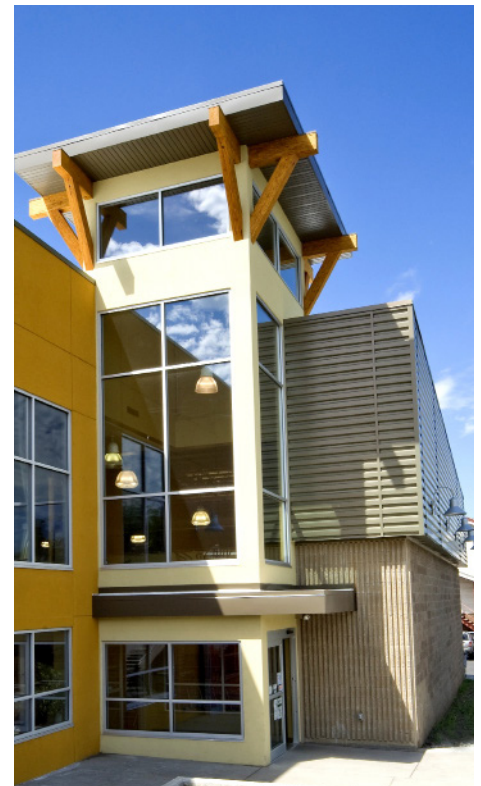
Town and Country Foods, Bozeman, MT

Additional product information is available from the manufacturer upon request. Metal Sales product information may be found in McGraw-Hill Sweets, ARCAT.