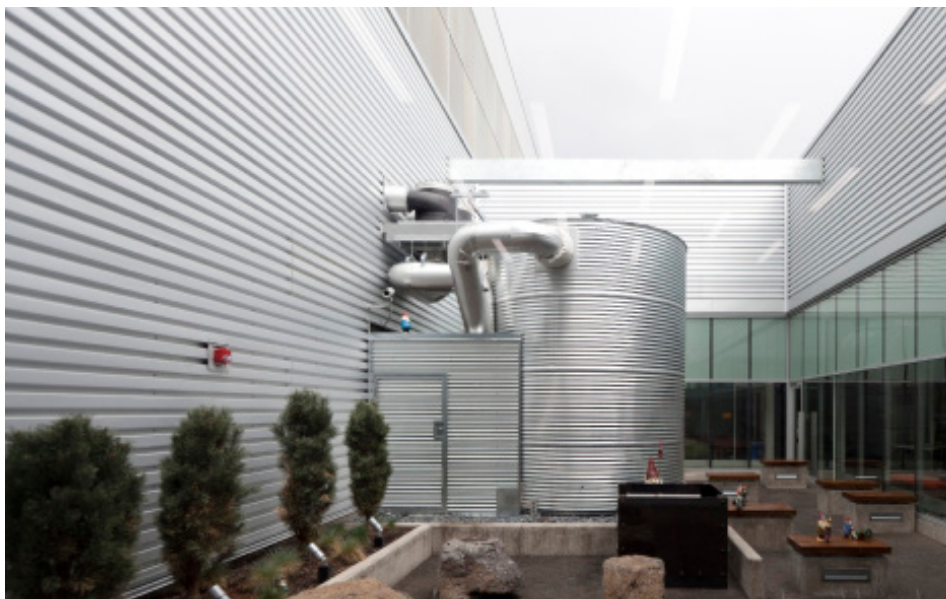
Facebook Data Center, Prineville, OR

Handle and store product according to Metal Sales recommendations. Deliver materials in manufactur-