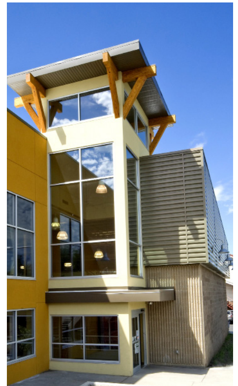
Town and Country Foods, Bozeman, MT

Additional product information is available from the manufacturer upon request. Metal Sales product information may be found in McGraw-Hill Sweets, ARCAT.