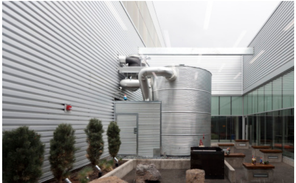
Facebook Data Center, Prineville, OR