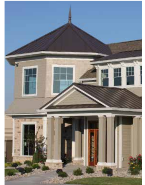
Denzinger Dentist Office, New Albany, IN