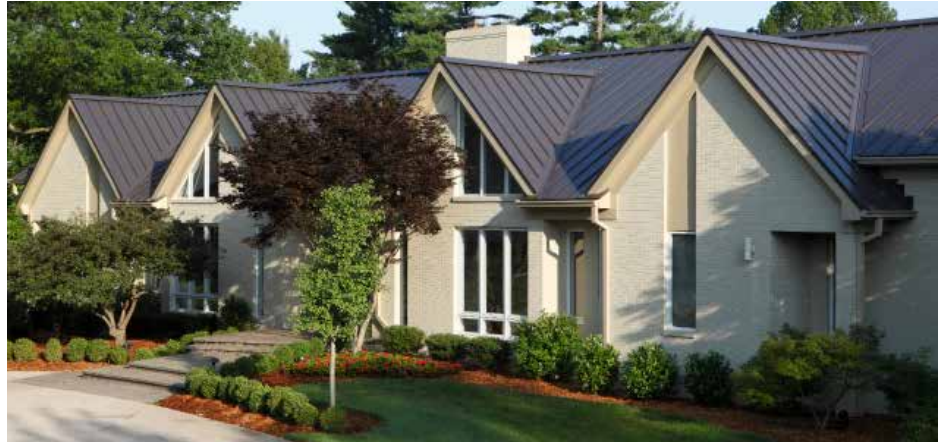
Residence, Louisville, KY

► Rib Height: 1 inch (25.4 mm) or 1-1/2 inches (38.1 mm).