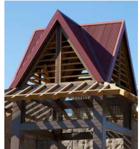
7/8" Corrugated Panel, Denver Zoo, Denver, CO