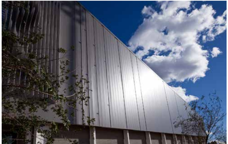
Grand Canyon University, Phoenix, AZ