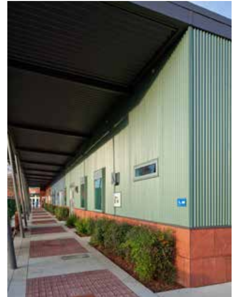
Silicon Valley Animal Center, Milpitas, CA