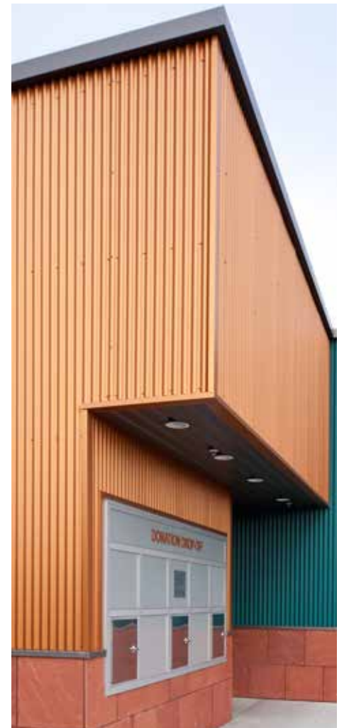
Silicon Valley Animal Center, Milpitas, CA

Additional product information is available from the manufacturer upon request. Metal Sales product information may be found online metalsales.us.com