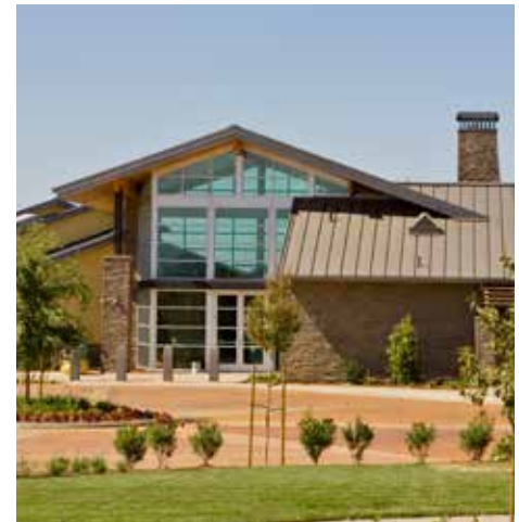
Club Lincoln Crossing, Lincoln, CA