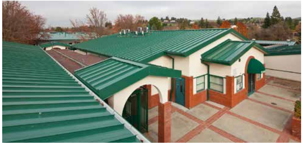
Charlotte Wood Middle School, Danville, CA