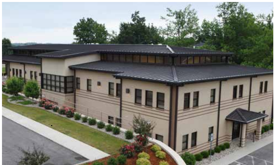
Medical Office, Elizabethtown, KY