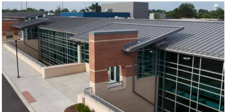
Charlestown High School, Charlestown, IN

To minimize possible differences in appearance, an entire project should be painted at one time, from one batch of paint, using the same application equipment. Additionally, fabricated panels, flat