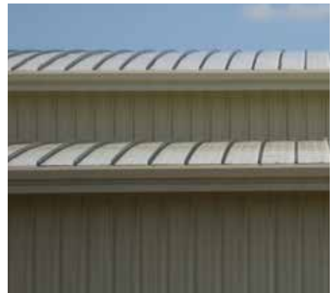
Visitor Center, Tuscon, AZ