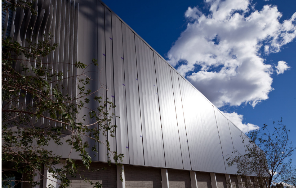
Grand Canyon University, Phoenix, AZ

▶ Panel Coverage: 28 inches (711.2 mm), 30 inches (762 mm) or 36 inches (914.4 mm). ▶ Rib Height: 1-1/2 inches (38.1 mm).