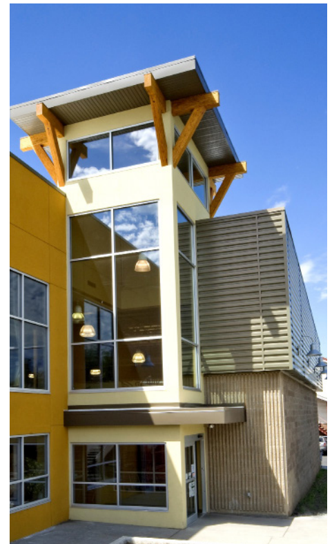
Town and Country Foods, Bozeman, MT

Additional product information is available from the manufacturer upon request. Metal Sales product information may be found in McGraw-Hill Sweets, ARCAT.