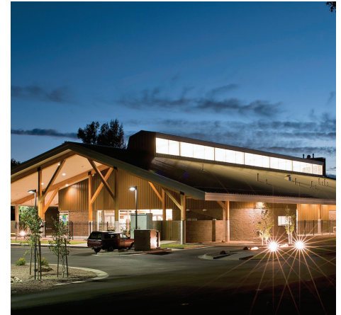
Show Low Library, Show Low, AZ