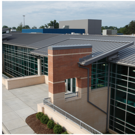
Charlestown High School, Charlestown, IN