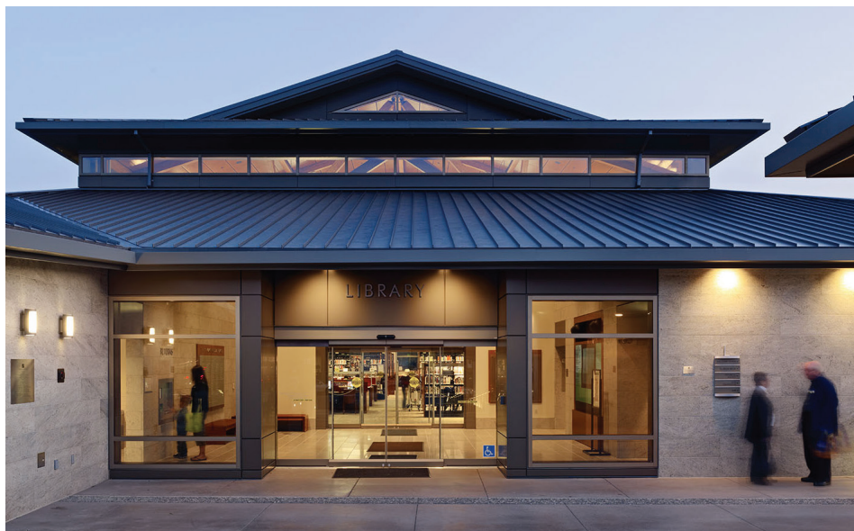
Lafayette Library and Learning Center, Lafayette, CA

If requested by Owner, provide manufacturer's field service consisting of product use recommendations and periodic site visits for inspection of product installation in accordance with manufacturer's instructions.