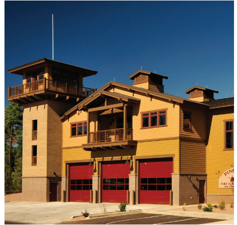
Pinetop Fire Station, Pinetop, AZ

Seam-Loc 24 is a registered trademark of Metal Sales.