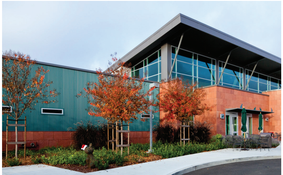
Silicon Valley Animal Center, Milpitas, CA

► Material: Aluminum-zinc alloy-coated steel sheet, ASTM A 792, AZ50 or AZ55 coating designation,