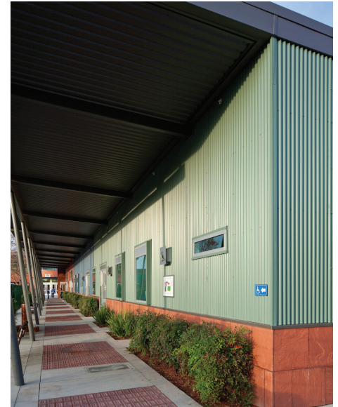
Silicon Valley Animal Center, Milpitas, CA

Systems by Uniform Static Air Pressure Difference Underwriters Laboratories (UL):