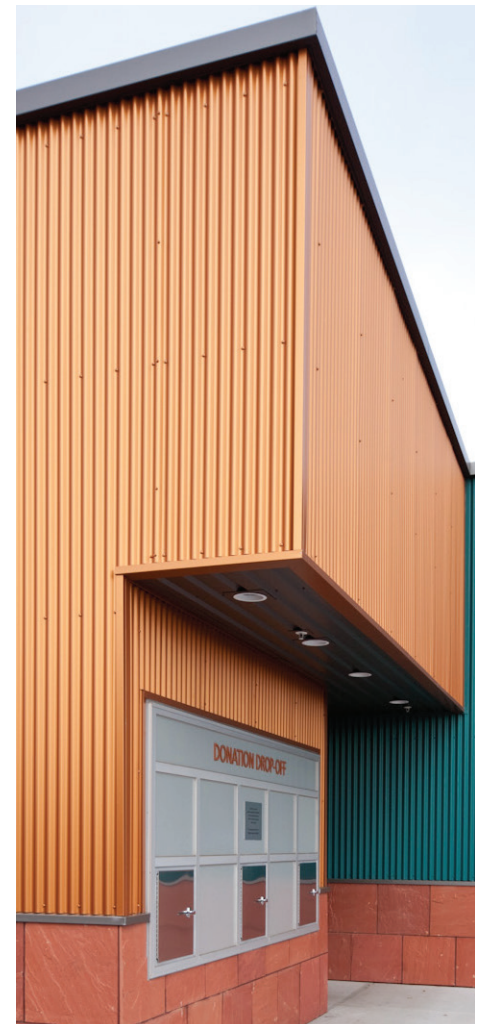
Silicon Valley Animal Center, Milpitas, CA

Additional product information is available from the manufacturer, upon request and from MasterSpec.