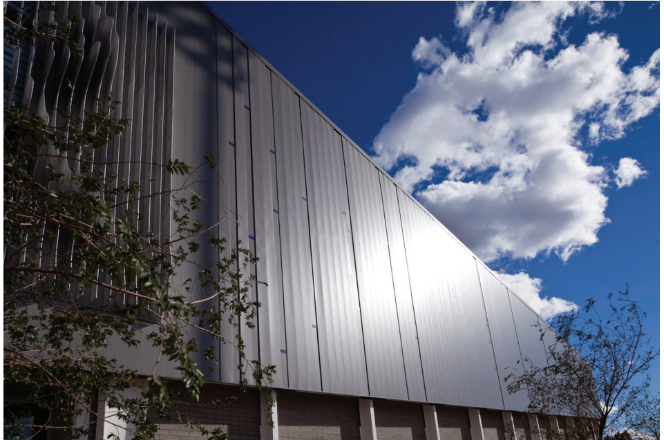
Grand Canyon University, Phoenix, AZ

Note: Industry designation for material thickness is moving away from “gauge” to decimal thickness in inches. Metal Sales recommends use of a minimum thickness requirement 0.0230 inch (0.58 mm) instead of 24 gauge, 0.0296 inch (0.75 mm) instead of 22 gauge, 0.0356 inch (0.90 mm) instead of 20 gauge and 0.0466 inch (1.18 mm) instead of 18 gauge. For Galvalume-coated steel, specify AZ50 for painted material or AZ55 for unpainted material.