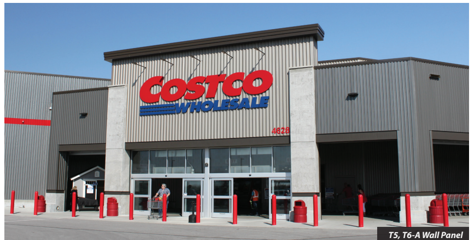
T5, T6-A Wall Panel