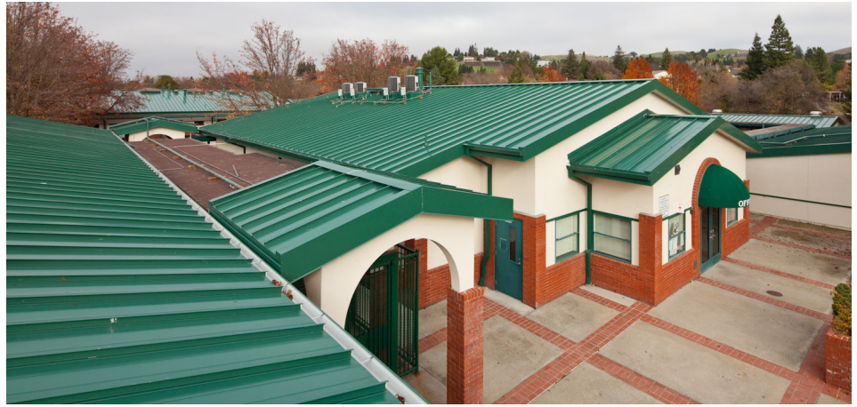
Charlotte Wood Middle School, Danville, CA