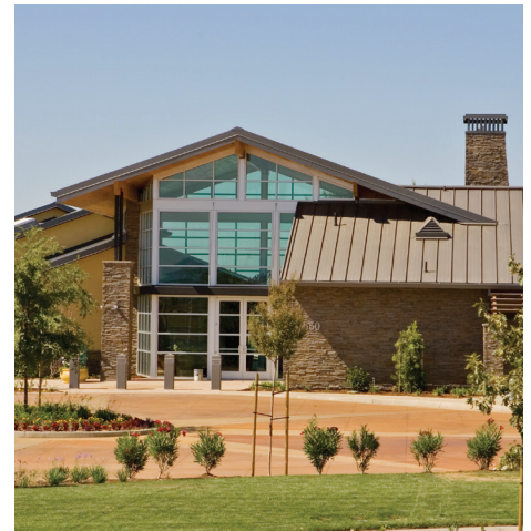
Club Lincoln Crossing, Lincoln, CA

Sheet Metal and Air Conditioning Contractors' National Association (SMACNA): Architectural Sheet Metal Manual