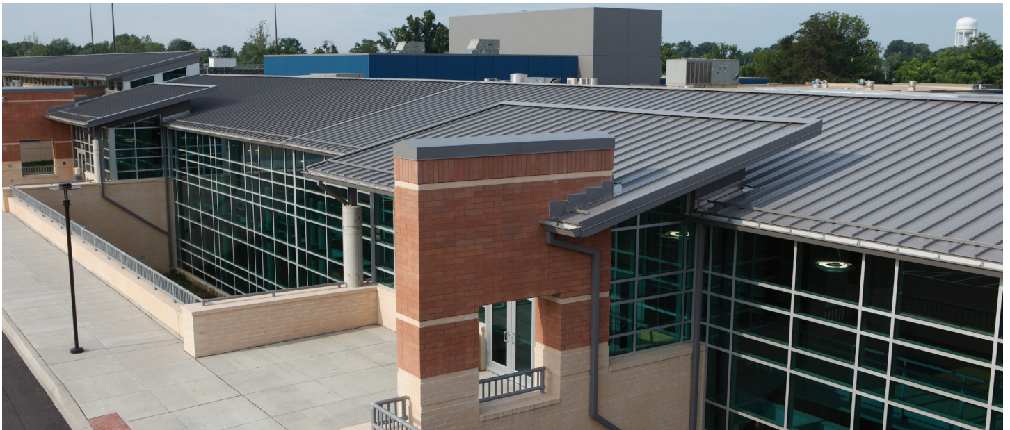
Charlestown High School, Charlestown, IN

Additional product information is available from the manufacturer, upon request and from MasterSpec.